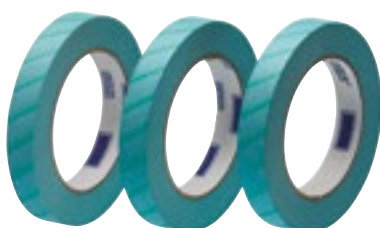
0167 Steam Hi Tack 18 mm (3/4") x 50 m