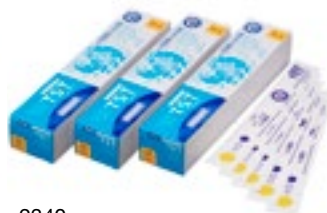
2340 Indicators 134 °C/3.5 mins