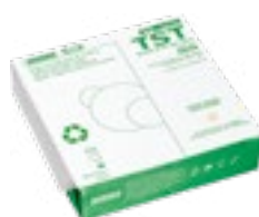
2365 TST Bowie Dick Test Pack for Prestige Medical (22,16 & 11 L)