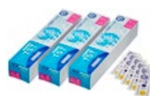
3760 134 °C/7 mins & 121 °C/20 mins