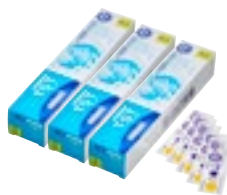
3706 134 °C/18 mins