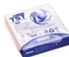
2352 TST Bowie Dick Test Pack for Matachana M20 - B