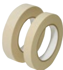
0160 Plain 18 mm (3/4") x 50 m