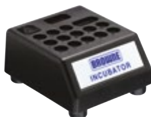
Triple Temperature Incubator 37 °C/57 °C or 60 °C