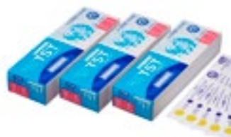
3726 134 °C/5.3 mins & 121 °C/15 mins Self-Adhesive