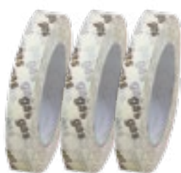
0151 Ethylene Oxide 18 mm (3/4") x 50 m