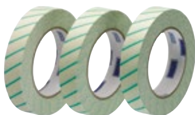
0163 Steam 24 mm (1") x 50 m