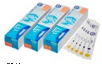
2341 134 °C/4 mins & 121 °C/12 mins