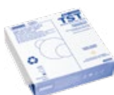
2356 TST Bowie Dick Test Pack for W&H Lisa MB 17/22