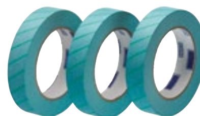
0168 Steam Hi Tack 24 mm (1") x 50 m