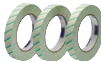
0162 Steam 18 mm (3/4") x 50 m