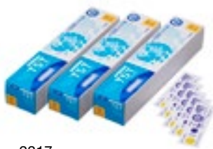
2317 Indicators 134 °C/3.5 mins 'Flash'

See product descriptions under images below