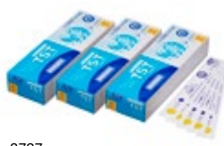
3727 134 °C/3.5 mins Self-Adhesive