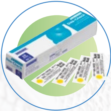
Disinfection Verification Indicators