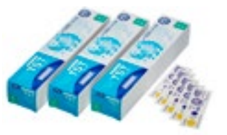
3702 134 °C/9 mins