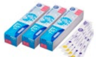
2342 134 °C/5.3 mins & 121 °C/15 mins