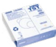
2358 TST Bowie Dick Test Pack for Eschmann Little Sister 3 Vacuum & SES 2000 Vacuum