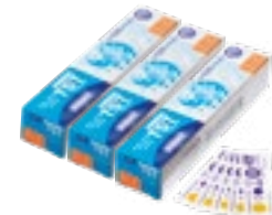
2375 134 °C/4 mins and 121 °C/12 mins