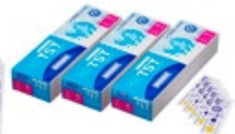
3725 134 °C/7 mins & 121 °C/ 20 mins Self-Adhesive