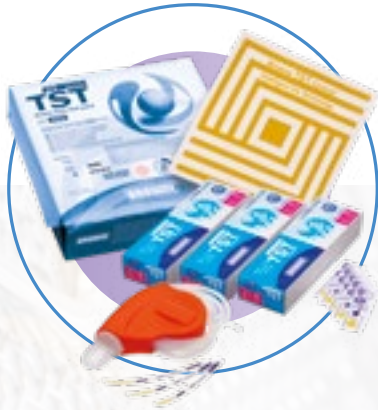
Sterilization Verification Indicators

Why not Ask Albert? He loves a challenge! askalbert@steris.com