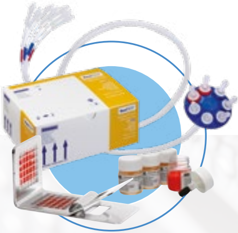
Cleaning Verification Indicators