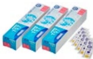
2302 134 °C/5.3 mins & 121 °C/15 mins